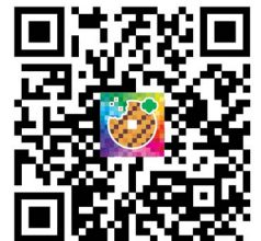
Digital Cookie Website

Digital Cookie is the Cookie sales platform. Girls will need to use a web browser to set up their sites, and thereafter they can use that and the Digital Cookie app. Girls can send customer emails, accept online orders for girl delivery or direct ship, accept credit card payments for in-person or booth orders, and manage on-hand inventory. Girls age 13+ can have their own login and customize and manage many portions of their Digital Cookie page themselves.