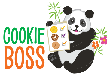
Cookie Rewards Details

Is honest and responsible at every step of the cookie sale. Her business ethics reinforce the positive values she is developing as a Girl Scout.