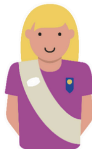
Cadette 6 th , 7 th , & 8 th