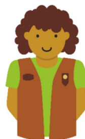
Brownie 2 nd & 3 rd