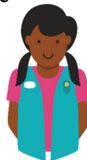
Junior 4 th & 5 th