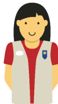
Senior 9 th & 10 th