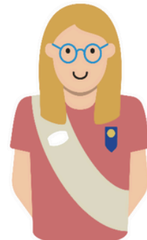
Ambassador 11 th & 12 th